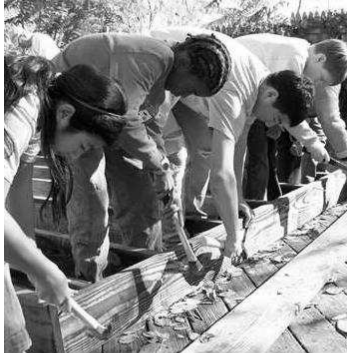
All Saints' Youth Group working hard to build a beautiful deck for the Ice Street Advocates' property

Please sign up to participate in Feed-A-Family for the next month. Information is located in the lower Gathering Space. As part of All Saints' advocacy to the homeless and those in need, we are also collecting non-perishable food items for the Frederick County Food Bank. Please place your offerings in the Gathering Space.